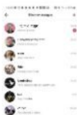
TikTok Direct Messages