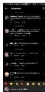
Instagram Direct Messages